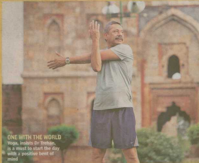
ONE WITH THE WORLD Yoga, insists Dr Trehan, is a must to start the day with a positive bent of mind

DR NARESH TREHAN, heart surgeon and chairman, Global Health Private Ltd, New Delhi