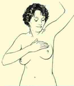
Breast Self-Exam - Step 5

Follow a pattern to be sure that you cover the whole breast. You can begin at the nipple, moving in larger and larger circles until you reach the outer edge of the breast. You can also move your fingers up and down vertically, in rows, as if you were mowing a lawn. This up-and-down approach seems to work best for most women. Be sure to feel all the tissue from the front to the back of your breasts: for the skin and tissue just beneath, use light pressure; use medium pressure for tissue in the middle of your breasts; use firm pressure for the deep tissue in the back. When you've reached the deep tissue, you should be able to feel down to your ribcage.