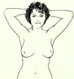
Breast Self-Exam Steps 2 and 3

Now, raise your arms and look for the same changes.