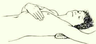
Breast Self-Exam - Step 4

While you're at the mirror, look for any signs of fluid coming out of one or both nipples (this could be a watery, milky or yellow fluid or blood).